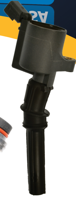
IC369 Ignition Coil Ford (2017-97)

*Cards are issued by Bank of America, N.A. pursuant to a license from Visa® Inc. These cards are not credit cards. They expire twelve (12) months from issue and have no value after that date. These cards may be used for purchases at merchants that accept Visa® debit cards. These cards may be subject to fees and certain restrictions on use. See the cardholder agreement and associated materials that come with your card for details.