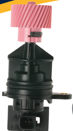
VSS704 Vehicle Speed Sensor Nissan (2003-95)