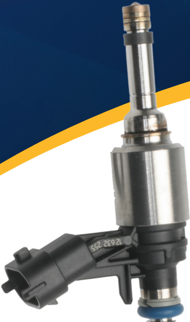
2-39061 GDI Fuel Injector GM (2011-08)