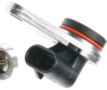
CSS208 Camshaft Sensor Chrysler (2009-95)